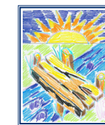
Mental Health in Later Life: A Guidebook for Older Marylanders and the People Who Care for Them

The Mental Health and Aging Coalition works to ensure a high quality of care